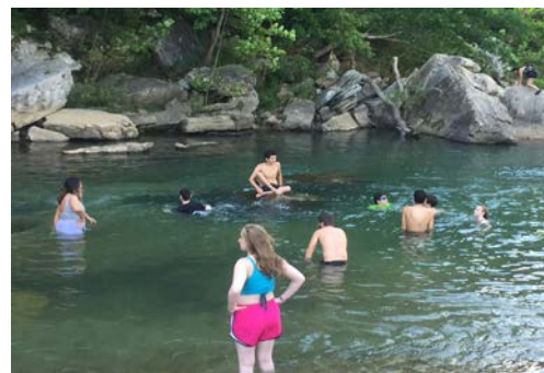
Swimming in the Buffalo River