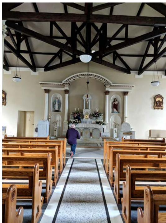
St. Patrick's Church in Kinsale.