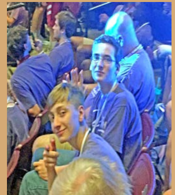
Our youth at Steubenville.