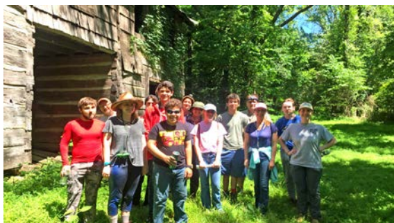
CYM going cave exploring in Jasper, Ark.