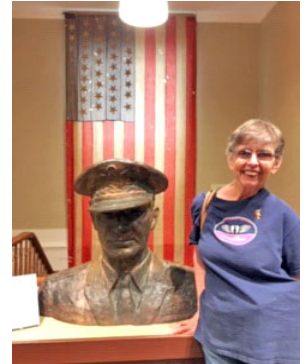
On July 25, the Seniors Group took a field trip to McArthur Park and Military Museum.