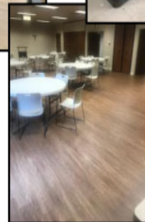
← Parish Hall Floors