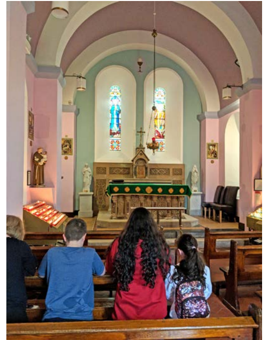
Chapel of St. Finbarr's Oratory