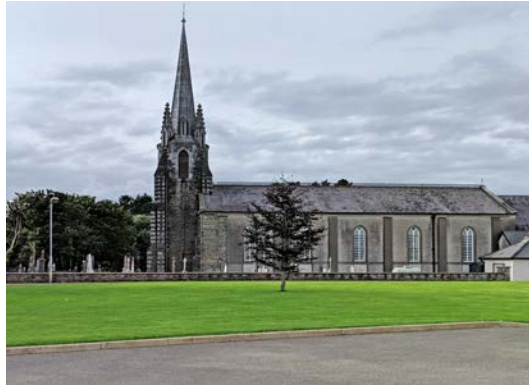
St. Mary's Church in Innishannon