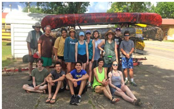
Float Trip to the Buffalo River