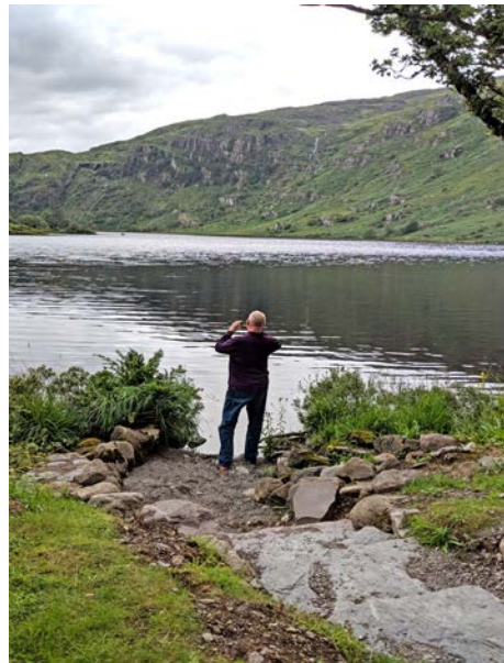
Gougane Barra Lake