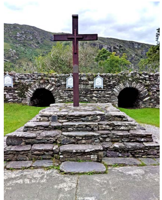
Old Monastery Site