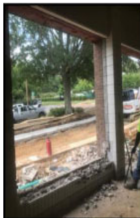
Doors into Cafeteria

Thank you all for your continued patience of our noise and messes while the work has been done. We hope to always have the opportunity to keep the campus beautiful and safe for all of our parishioners, and you take note and enjoy the updates around the campus. None of these projects would be possible without generous and caring people helping support Holy Souls Parish