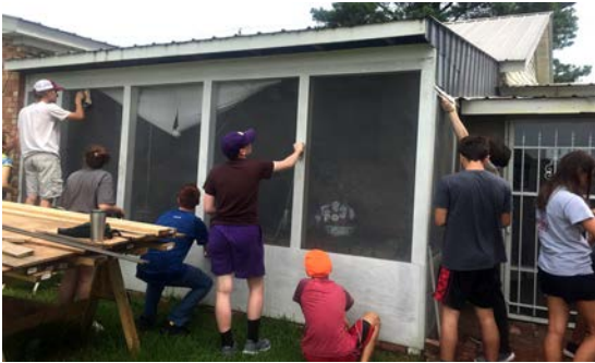
Painting porch of local resident.