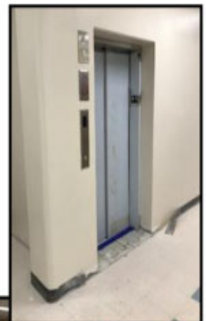
School ↑ Elevator