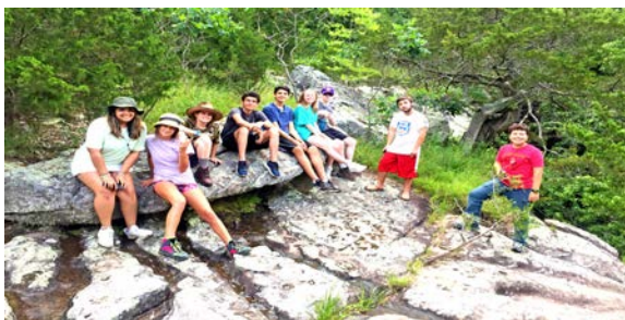
Sweden Creek Falls Hike